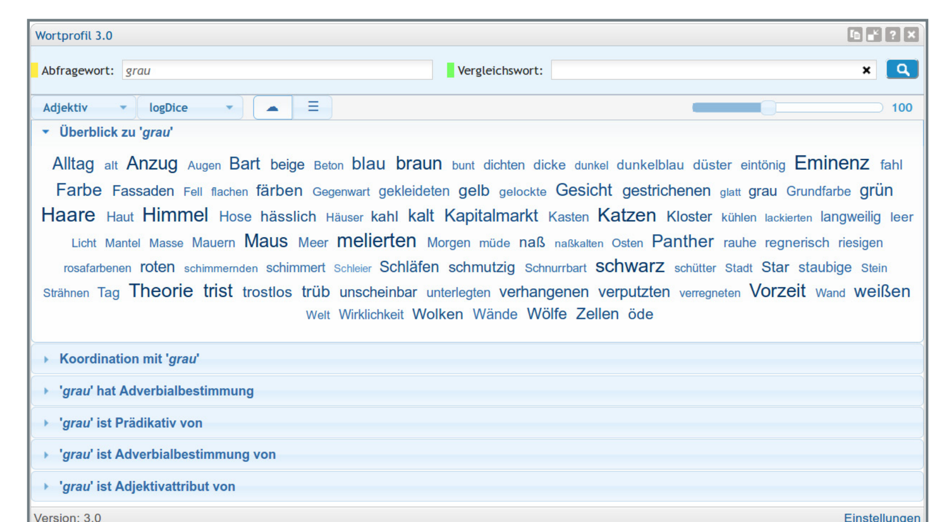
Figure 3: The word's profile illustrates in the form of a tag cloud the other words with which it typically occurs. It is also possible to filter for the grammatical relation between the two words. The evaluation and presentation is based on the DWDS's core corpus of the 20th century and the ZEIT-Korpus. Here we are shown the words with which the word 'grau' (grey) typically appears. The words displayed in larger size are the 'most typical' co-occurring words ('Eminenz' (eminence), 'Maus' (mouse), 'Panther' (panther) etc.).

Additionally, we are partner in a project which aims at building a large German reference corpus of computer-mediated communication (DeRiK, Deutsches Referenzkorpus der internetbasierten Kommunikation ). We are also co-operating with other large resource providers, e.g. the Institut für Deutsche Sprache, in a large European Research Infrastructure project (CLARIN, Common Language Resources and Technology Infrastructure).