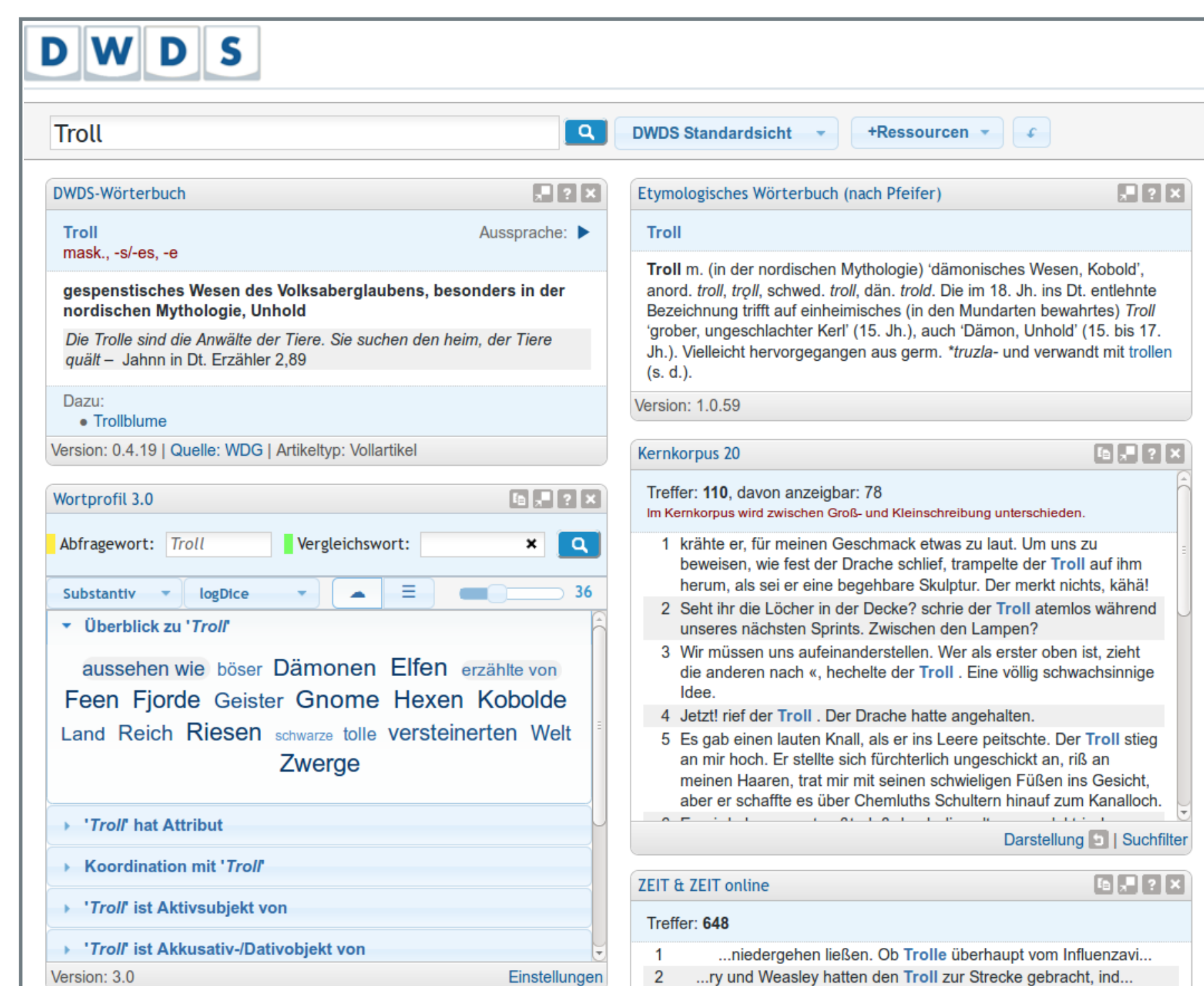
Figure 1: Web frontend to the DWDS system ( www.dwds.de ). The frontend aligns several resources in panels which display search results in the respective resource for the search expression ('Troll', in our example).

...is a lexical information system developed by and hosted at the BBAW. The system offers one-click-access to three different types of resources: a) Lexical resources such as the DWDS-Wörterbuch , the Wörterbuch der deutschen Gegenwartssprache (WDG), Etymologisches Wörterbuch by Wolfgang Pfeifer, and the Deutsches Wörterbuch by Jacob Grimm and Wilhelm Grimm, b) a large, linguistically annotated German corpus of 20th and 21st century texts containing about 1.8 billion tokens. The DWDS corpus consists of two parts: a core corpus and an extended corpus. The core corpus contains approximately 100 million running words, balanced chronologically and by text genre in approximately 80,000 documents. The extended corpus contains more than 1.7 billion text words. It is an opportunistic corpus, consisting